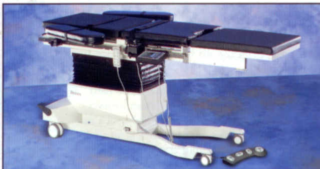
Radiolucent extension converts the Urology Table into a general purpose C-Arm Table.